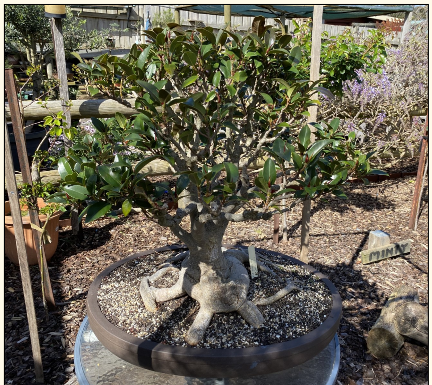
PORT JACKSON FIG —This Fig I inherited from my mother, it is now 60 years old.