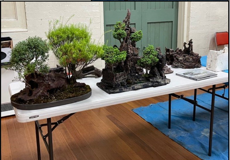
Polystyrene Rock In middle of pot. Left