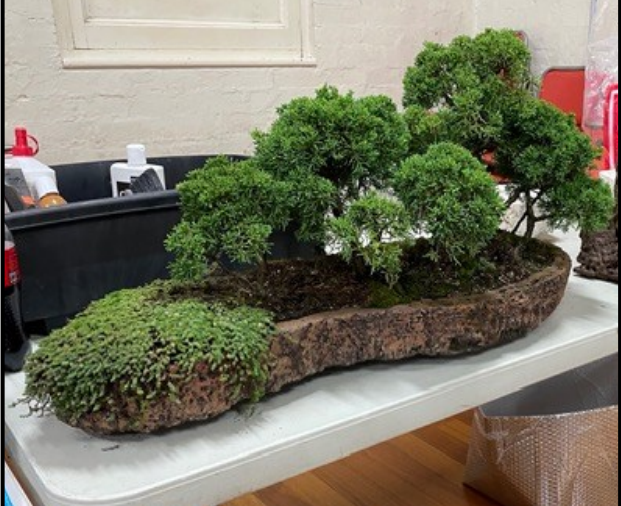
A Polystyrene pot with planting.