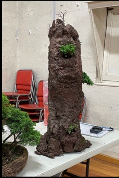
A very large rock made by Val and planted with trees. Only just been created in the last month.