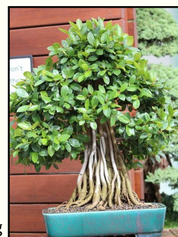
Port Jackson fig