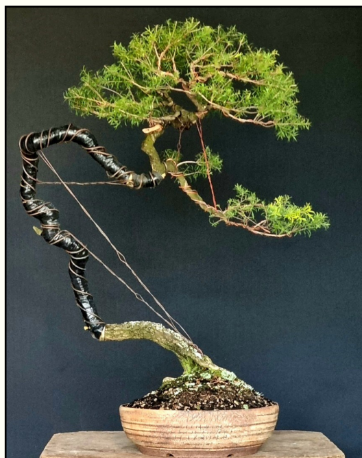
Melaleuca Bracteata 'Gold Gem'

The transformation of two different trees Melaleuca Bracteata 'Gold Gem' & Melaleuca Raphiophylla , Swamp Paperbark