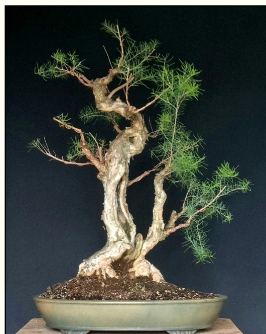
Melaleuca Raphiophylla , Swamp Paperbark