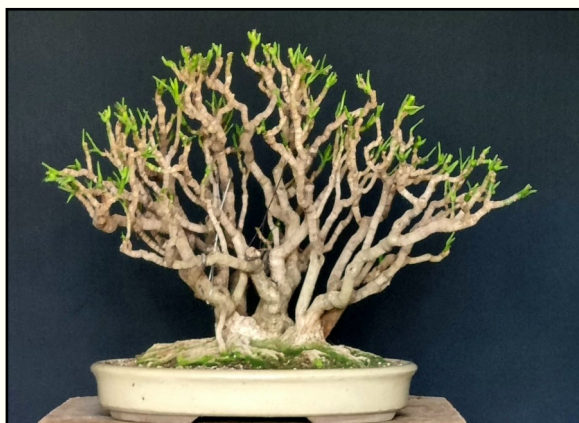
Dwarf Umbrella Tree. Before & After