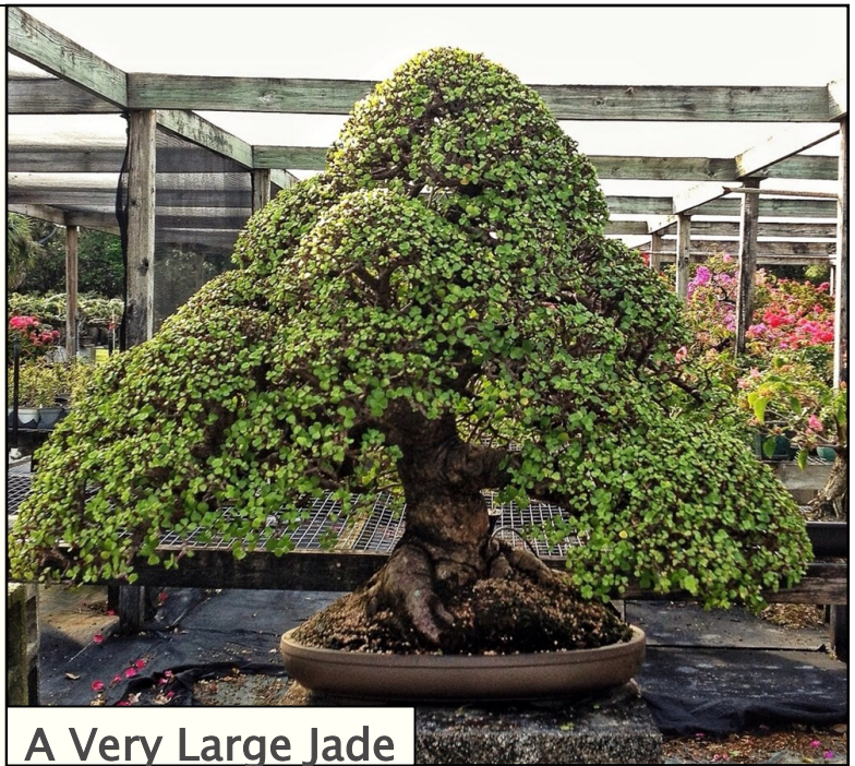
A Very Large Jade

House Keeping —Try to remove all fallen leaves from your benches and pots. As well as keeping the area tidy and clean, this removes a potential source and habitat for pests and diseases. Scrub down the benches to remove algae and dirt build-ups.