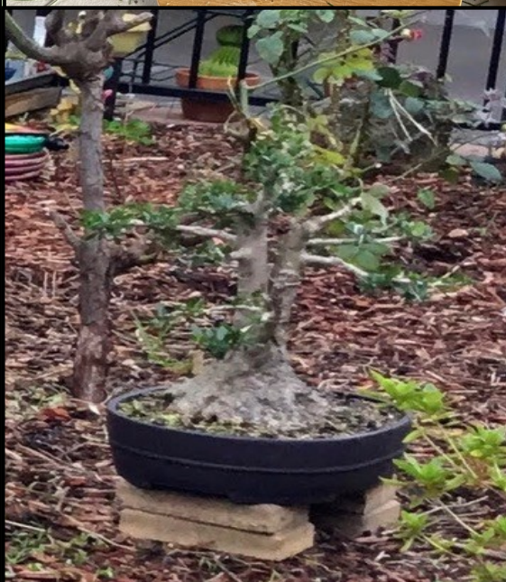
Gwen's Olive before, and later after much pruning and scraping.