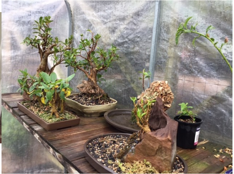
Some more trees in Gwen's glasshouse/hothouse